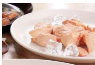
ZCAN025 - kg. 2 Duck foie gras nuggets