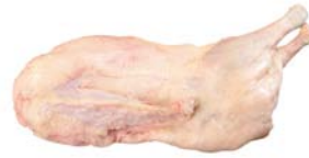
OC013 - kg. 3,5 Semi-boneless Toulouse Goose ("paletot" cut)