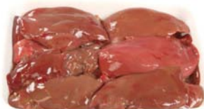
AN007 - g. 30 Duck's raw liver pieces