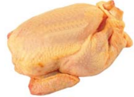
PL222 - kg. 1,4 Whole pullet