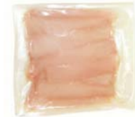
CO025 - g. 50 Rabbit fillet - short cut