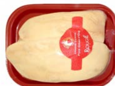
ZCOC024 - g. 600 - 900 Whole goose foie gras