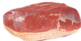
AN004 - g. 450 Drake breast