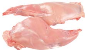
CO006 - g. 250 Rabbit leg