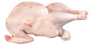
PL341 - kg. 5 Whole Turkey-hen