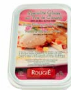
ZCAN029 - ml. 750 Duck foie gras ice cream