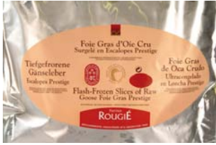
ZCOC020 - kg. 1,4 Goose foie gras escalope