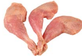
PL109 - g. 16 Quail legs