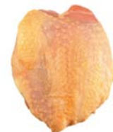
FA003 - g. 300 Guinea Fowl breast (wingless)