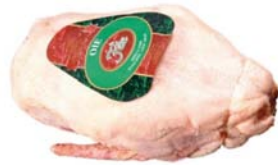
OC001 - kg. 4 Roast snow goose