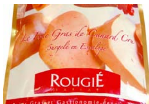
ZCAN031 - kg. 1,4 Mini-escalope of duck foie gras