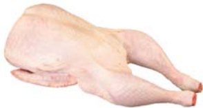
PL342 - kg. 4 Boneless Turkey-hen