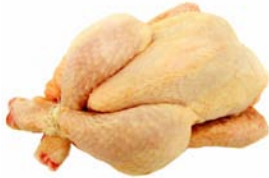
PL215 - g. 500 Whole cockerel