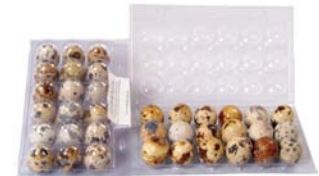
PL111 Fresh quail eggs