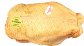
AN014 - kg. 1,7 Whole Barbary duck