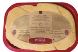
ZCOC022 - kg. 3 Cleaned goose foie gras