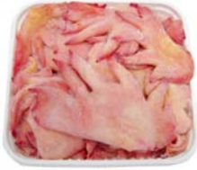
ZCPL226 - g. 900 Cockrels' crests (to be preserved at -18°C)