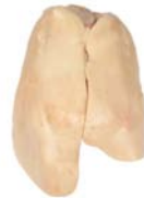
OC005 - g. 700 Goose foie gras - extra quality grade