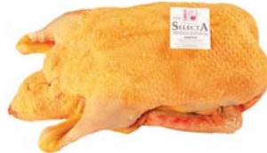
AN001 - kg. 2,2 Female Duck