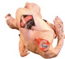
PL231 - kg. 3,5 Bresse Turkey PDO (available upon reservation from 15th to 31st December)