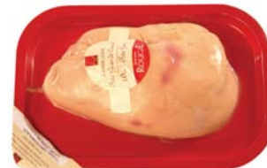
AN009 - g. 500 Mulard foie gras - first quality grade