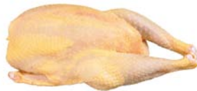
PL251 - kg. 1,5 Boneless capon