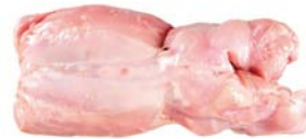
CO002 - g. 800 - 900 Boneless rabbit