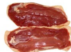
AN018 - g. 200 Barbary duck breast