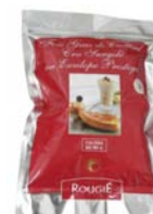
ZCAN035 - g. 60 - 80 Duck foie gras escalope - Prestige