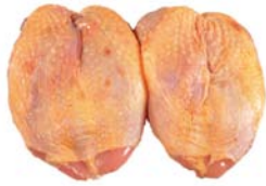
FA007 - g. 300 French Guinea Fowl fillet (wingless)