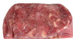
ZCAN020 - g. 800 - 1000 Duck meat (to keep at -18°C)

"ROUGIÉ" flash-frozen goose and duck foie gras