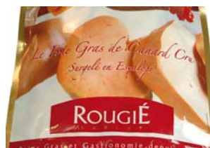
ZCAN022 - kg. 1,9 Duck foie gras escalope