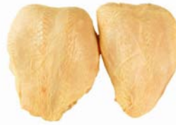
PL227 - g. 350 Cockerel breast with wing