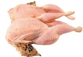
PL144 - g. 220 Giant Quail