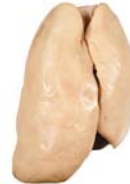
OC006 - g. 600 Goose foie gras - first quality