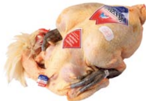
PL223 - kg. 2,2 Bresse Chicken PDO