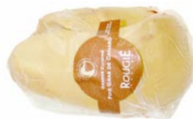
ZCAN033 - g. 450 - 600 Whole duck foie gras