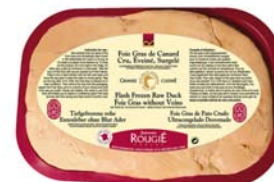
ZCAN027 - kg. 3 Cleaned duck foie gras

"ROUGIÉ" flash-frozen goose and duck foie gras