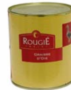
OC010 - g. 700 Refined melted goose fat