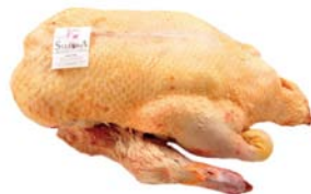
AN002 - kg. 3,3 - 4 Drake