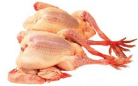
PL008 - g. 400 Hand-plucked pigeon gr.400