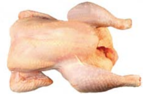
PL224 - kg. 2,5 Whole farmyard chicken