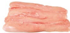
CO005 - g. 80 Rabbit fillet