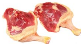
AN006 - g. 300 - 350 Drake leg