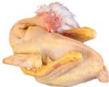
PL221 - kg. 2,5 Capon