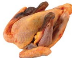
FA001 - kg. 1,5 Whole Guinea Fowl