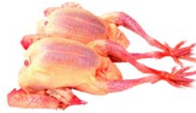
PL007 - g. 500 Hand-plucked pigeon gr.500