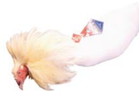
PL230 - kg. 4 Bresse Capon PDO (available upon reservation from 15th to 31st December)