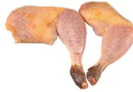
FA005 - g. 170 - 190 Guinea Fowl leg