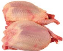
PL035 - g. 250 Boneless pigeon