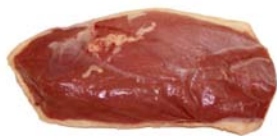
AN005 - g. 350 Mulard duck breast