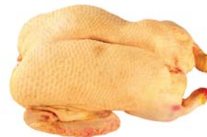
AN012 - kg. 1,3 Bonesless Duck