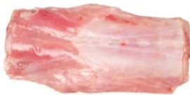
CO003 - g. 500 Rabbit loin