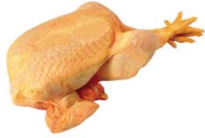
PL217 - kg. 3 Chicken