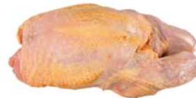
FA002 - g. 700 Boneless Guinea Fowl