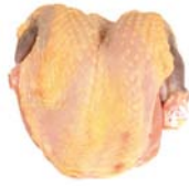
FA012 - g. 200 Supreme Guinea Fowl (half breast with wing)