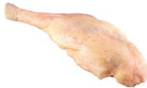
OC003 - g. 350 - 400 Confit goose leg