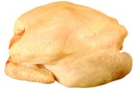
PL225 - g. 700 Boned cockerel