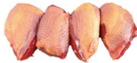
PL036 - g. 100 - 125 Pigeon breast