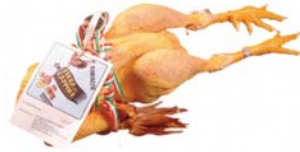
PL235 - kg. 3 Traditional Capon of Morozzo (available in December)