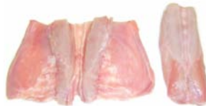
CO015 - g. 250 - 300 Boneless rabbit loin