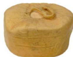
FM142 - kg. 1,3 Milk: sheep Grotto-ripened "Pecorino" cheese