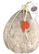
FM135 - kg. 2,5 - 3 Milk: cow "Provolone del Monaco" PDO cheese