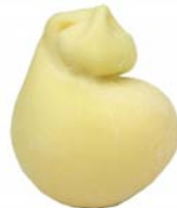
FM742 - kg. 1 Milk: cow "Provola" cheese from the Madonie mountains