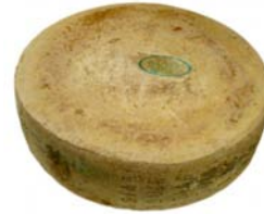
FM185 - kg. 8,5 Milk: cow "Asiago d'allevato" PDO cheese - whole wheel