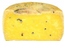
FSC162 - kg. 1,6 "Piacentinu ennese" PDO cheese - Region of origin Sicily - half wheel