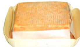
FM153 - g. 500 - 600 Milk: cow "Robiolina passita" cheese