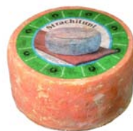
FM187 - kg. 4,5 Milk: cow "Strachitunt" cheese - whole wheel