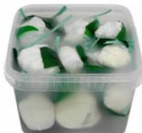
FM736 - 350 g Milk: cow Traditiona "burrata" cheese