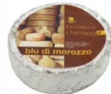
FM161 - g. 500 Milk: cow "Blu di Morozzo" cheese (blue cheese)