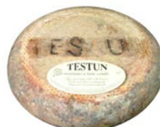
FM189 - kg. 6,7 Milk: cow "Testun di grotta" cheese - whole wheel