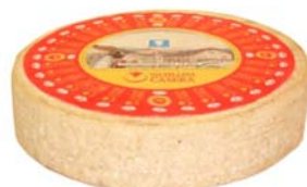
FM193 - kg. 6 Milk: cow "Valtellina Casera" PDO cheese - whole wheel