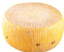
FSC161 - kg. 3,3 Milk: sheep "Piacentinu ennese" PDO cheese