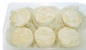
FM158 - g. 40 Milk: cow Mini "Tomino" cheese for grill