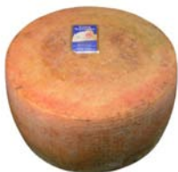
FM188 - kg. 10-12 Milk: sheep FM139 - "Gran Nuraghe (Granglona)" cheese