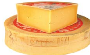
FM124 - kg. 1,3 Milk: cow, goat "Bitto" PDO cheese (over 10-year ripening) - 1/4 cut