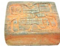
FM712 - kg. 2 Milk: cow "Quartiolo" PDO cheese - whole wheel