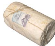
FM159 - kg. 1,8 Milk: cow "Blu del Monviso" cheese (blue cheese)