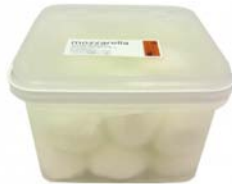
FM732 - 20 x 100 g Milk: cow "Mozzarella" cheese