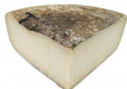
FM128 - g. 800 Milk: cow "Testun di grotta" cheese - 1/4 cut