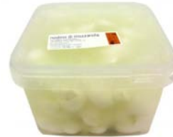
FM734 - 40 x 50 g. Milk: cow "Nodino di mozzarella" (small knot of mozzarella cheese)