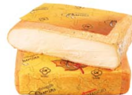
FM150 - kg. 2 Milk: cow "Taleggio" PDO cheese