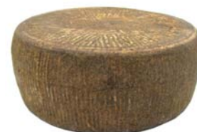
FM162 - kg. 10 Milk: cow Tuma persa- whole wheel