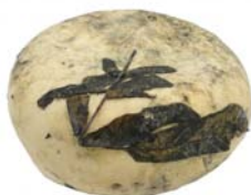
FM144 - kg. 1,2 Milk: sheep "Pecorino" cheese of Pienza ripened in walnut leaves