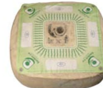
FM191 - kg. 9 Milk: cow "Raschera" PDO cheese - whole wheel