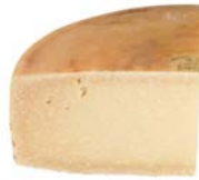
FM126 - kg. 1,2 Milk: cow "Asiago d'allevato" PDO cheese - 1/4 cut