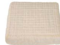
FM109 - g. 700 Milk: cow "Rubbia" cheese