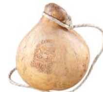
FSC130 - kg. 2 Milk: cow "Caciocavallo Podolico" semi-hard cheese