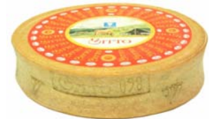
FM196 - kg. 10,5 Milk: cow, goat "Bitto" PDO cheese (over 10-year ripening) - whole wheel