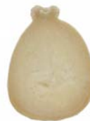
FM100 - kg. 1,6 Milk: cow "Caciocavallo Lucano" cheese - whole wheel