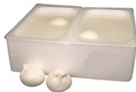
FM129 - g. 100 Milk: cow "Burratina" cheese