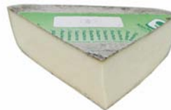
FM125 - kg. 1,1 Milk: cow "Raschera" PDO cheese - 1/4 cut