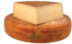
FM130 - kg. 1,2 Milk: cow "Bagoss di Bagolino" cheese - 1/4 cut