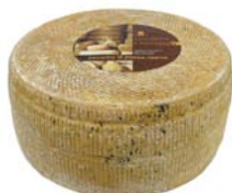
FM140 - kg. 5,5 Milk: sheep "Pecorino" cheese of Pienza "Reserve"