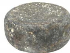
FM146 - kg. 1,2 Milk: sheep Ripe "Pecorino" cheese of Pienza