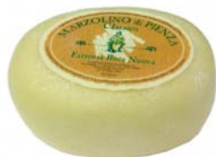
FM710 - g. 600 Milk: sheep "Marzolino" cheese - whole wheel