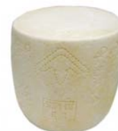
FM183 - kg. 22 - 23 Milk: sheep "Pecorino Romano" PDO cheese - whole wheel