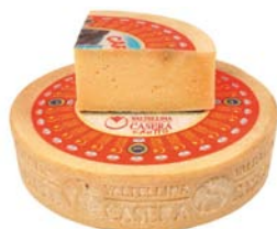
FM138 - g. 800 Milk: cow "Valtellina Casera" PDO cheese - 1/4 cut