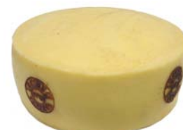
FM799 - kg. 13 "Vernengo Cime di Vezzena" cheese - whole wheel (from February to June)