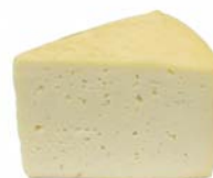
FM790 - kg. 1,6 "Vernengo Cime di Vezzena" cheese - 1/4 cut (from February to June)