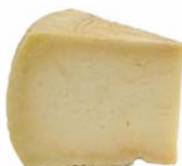
FSC160 - kg. 1,2 Milk: sheep "Pecorino Siciliano" PDO cheese - 1/4 cut