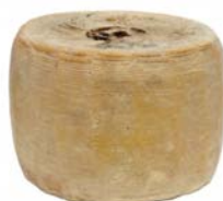
FSC198 - kg. 10 Milk: sheep "Pecorino Siciliano" PDO cheese - whole wheel