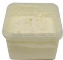
FM728 - 2 kg Milk: cow "Stracciatella" cheese