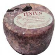
FM165 - g. 600 Milk: cow "Testun ciuc" cheese (rind treated with red wine)