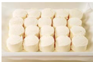
FM155 - g. 35 Milk: cow "Fresh Tomini" cheese