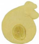
FM750 - 1 kg Milk: cow "Provola" cheese from the Madonie mountains with lemon