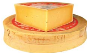
FM748 - kg. 1,3 Milk: cow, goat "Bitto" PDO cheese (year 2010) - 1/4 cut