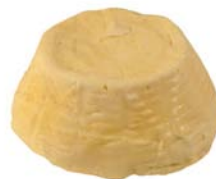
FM102 - g. 250 Milk: sheep Juniper-smoked "ricotta" cheese