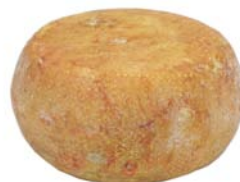
FM145 - kg. 1,3 Milk: sheep Half-ripened "Pecorino" cheese of Pienza