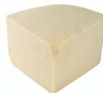
FM134 - kg. 1,5 Milk: sheep "Pecorino Romano" PDO cheese - 1/4 cut