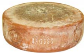
FM195 - kg. 17 Milk: cow "Bagoss di Bagolino" cheese - whole wheel