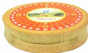
FM791 - kg. 10,5 Milk: cow, goat "Bitto" PDO cheese (year 2010) - whole wheel