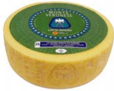
FM797 - kg. 8,5 Milk: cow "Fresh Monte Veronese" PDO cheese - whole wheel