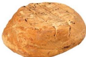
FM133 - g. 500-900 Milk: cow Ripe smoked "ricotta" cheese