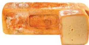
FM136 - kg. 1 Milk: cow "Ragusano" PDO cheese (cheese of Ragusa) - slice of cheese