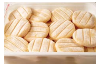
FM152 - g. 80 Milk: cow "Tomini" cheese for grill