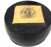
FM175 - kg. 12 Milk: cow "Oro Nero" (black rind parmesan cheese) - whole wheel